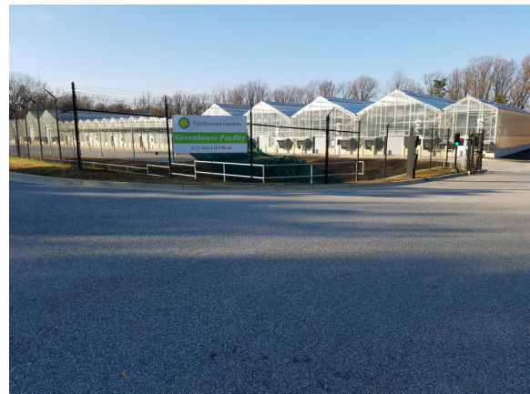
Approaching the Greenhouses