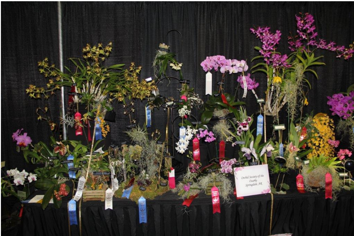
Display by the Orchid Society of the Ozarks Springdale, Arkansas