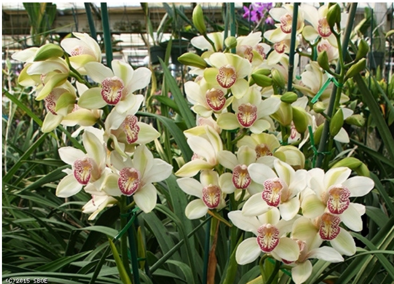
Cymbidium Fall Festival