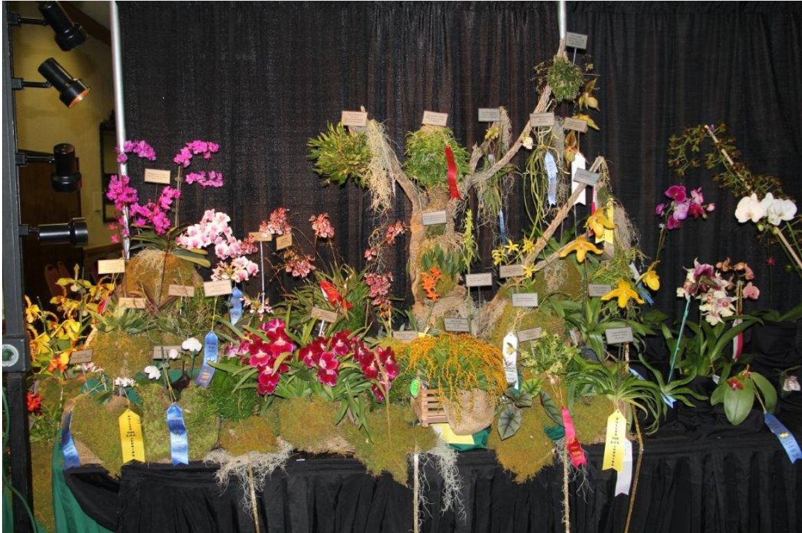
Display by Byron Rinke Winfield, Kansas