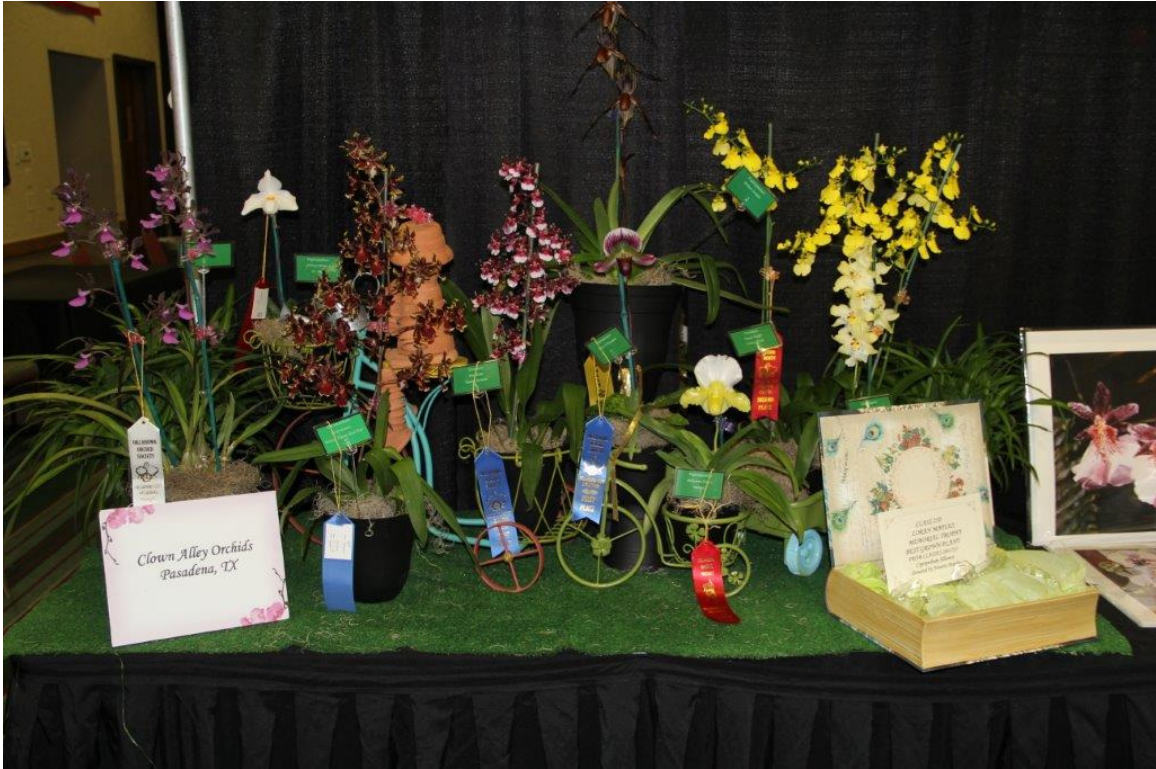
Vendor: Clown Alley Orchids Pasadena, Texas