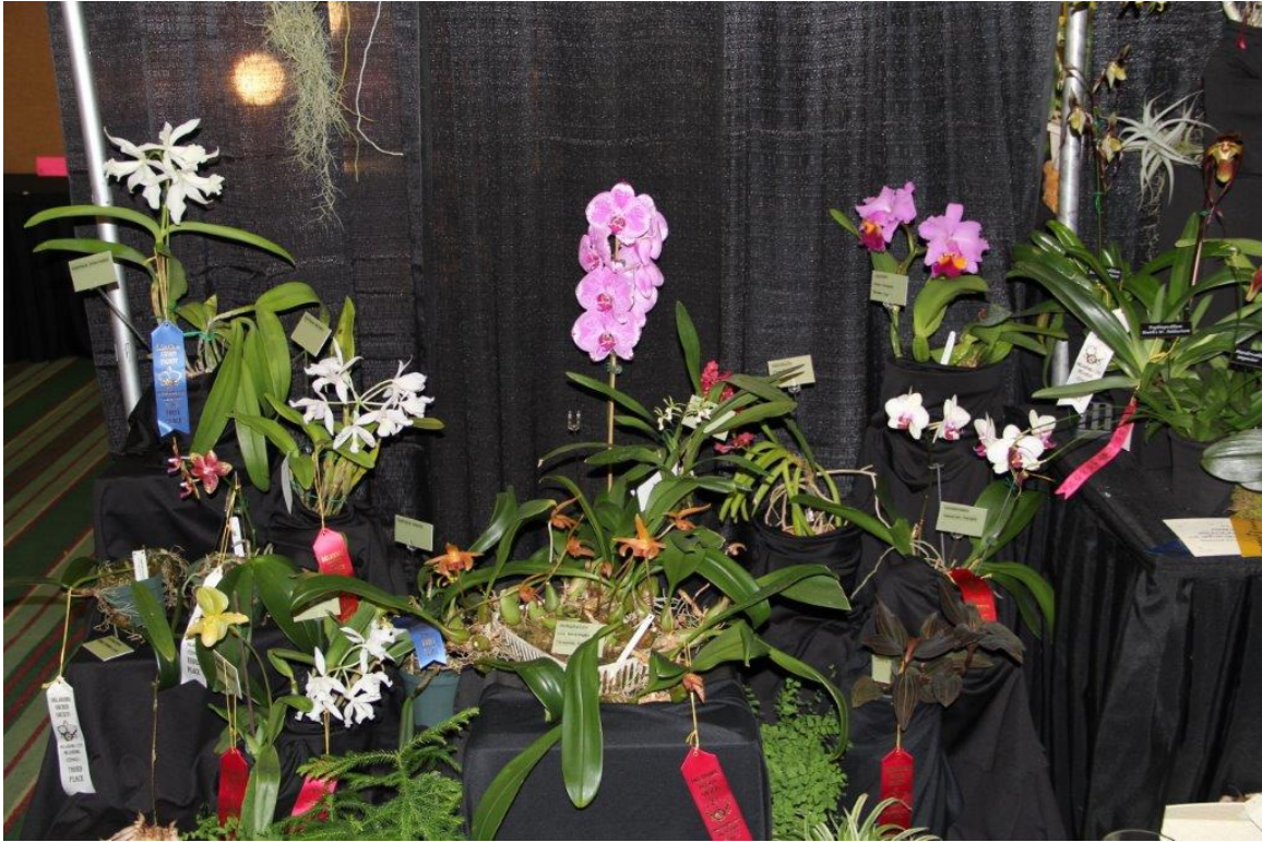
Display by the Arkansas Orchid Society Little Rock, Arkansas