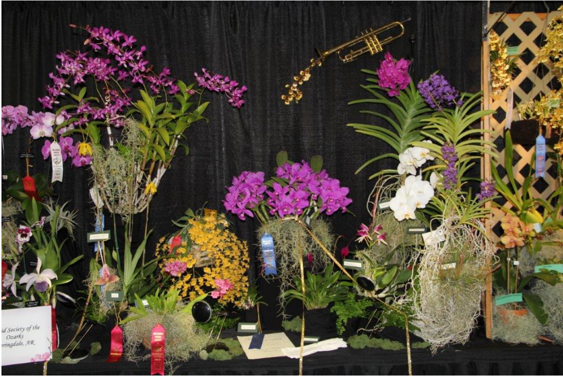
Display by the Tulsa Orchid Society