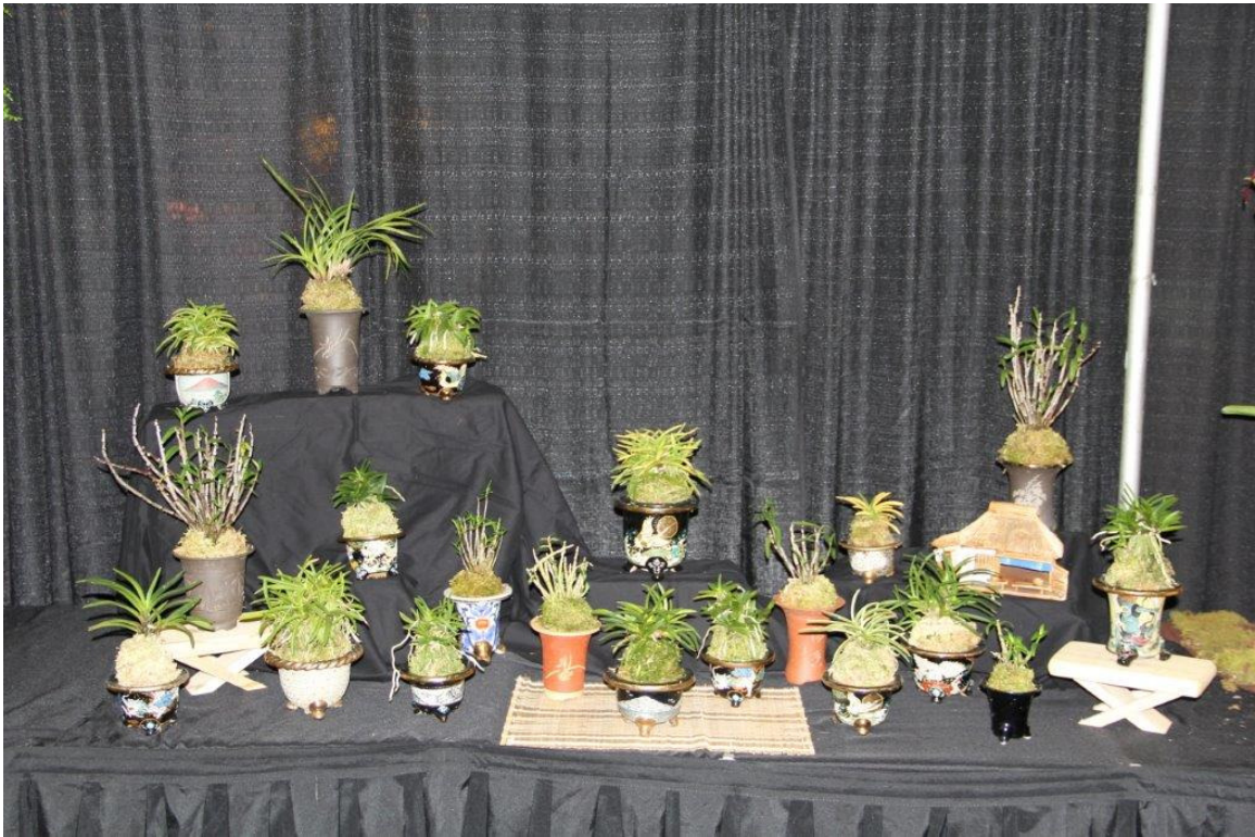
Vendor: New World Orchids Manchester, Michigan