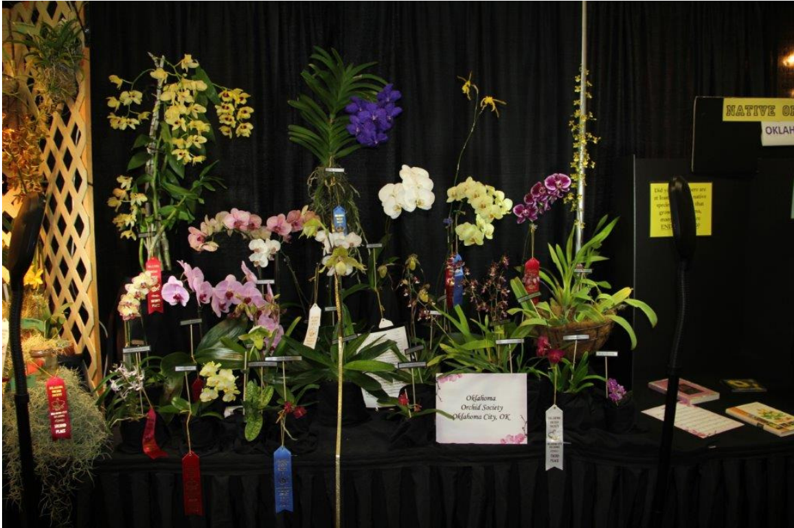
Display by Host Oklahoma Orchid Society Oklahoma City, Oklahoma