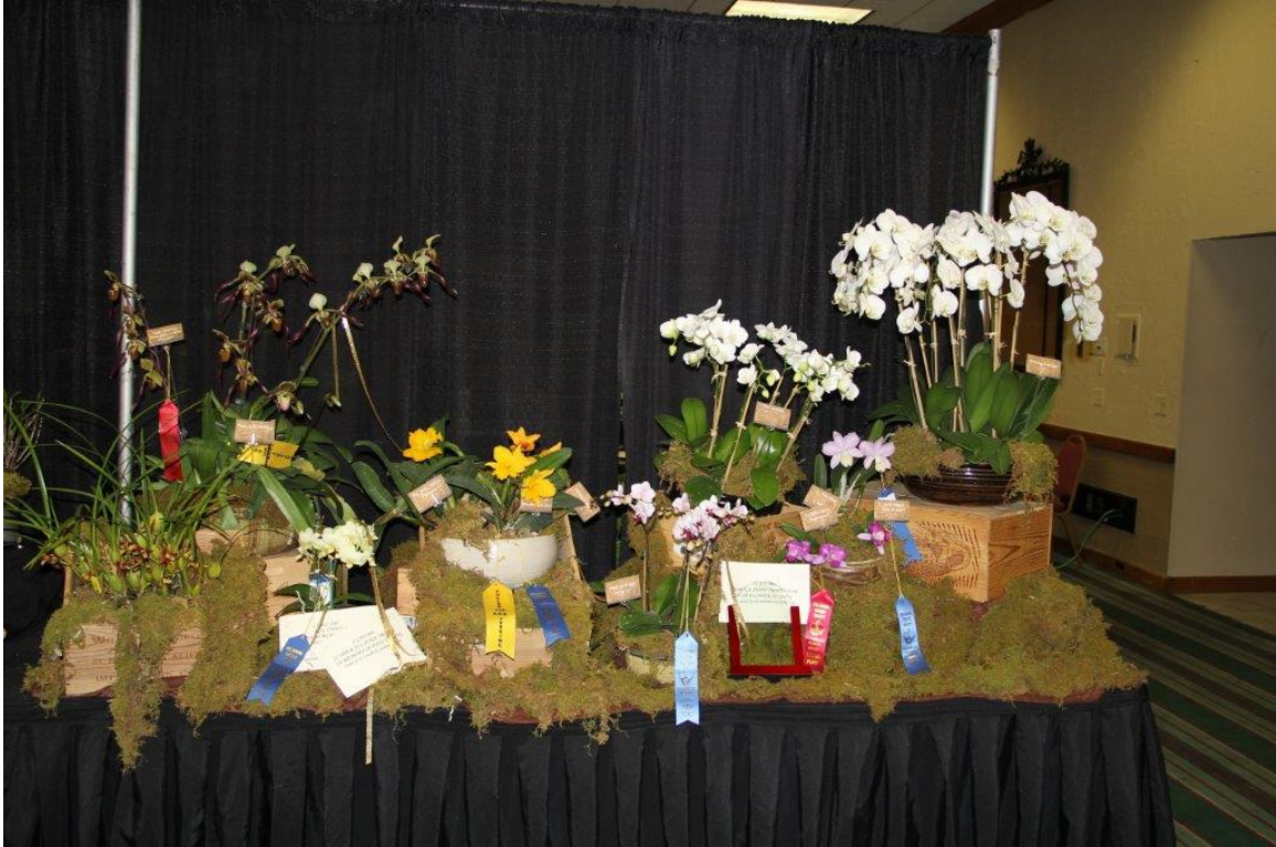
Vendor: New Earth Orchids Display Santa Fe, New Mexico