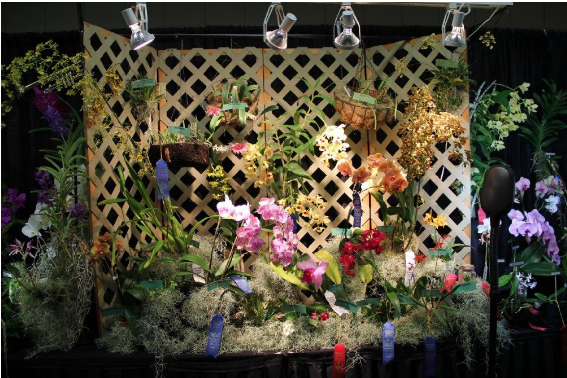
Display by the Red River Orchid Society Wichita Falls, Texas