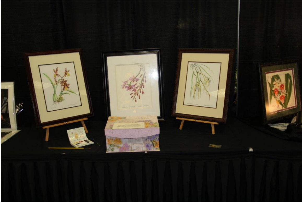
Display of Orchid Art by Charles Hess Dallas, Texas