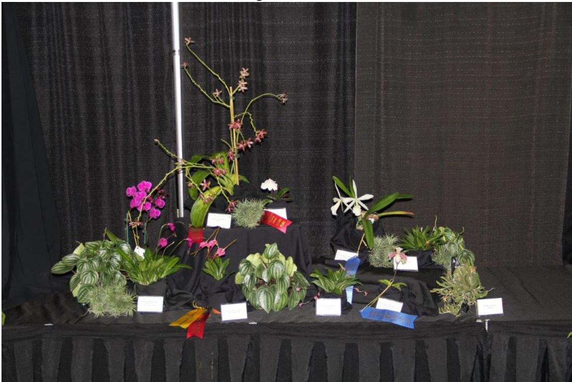
Vendor: Prairie Orchids El Dorado, Kansas