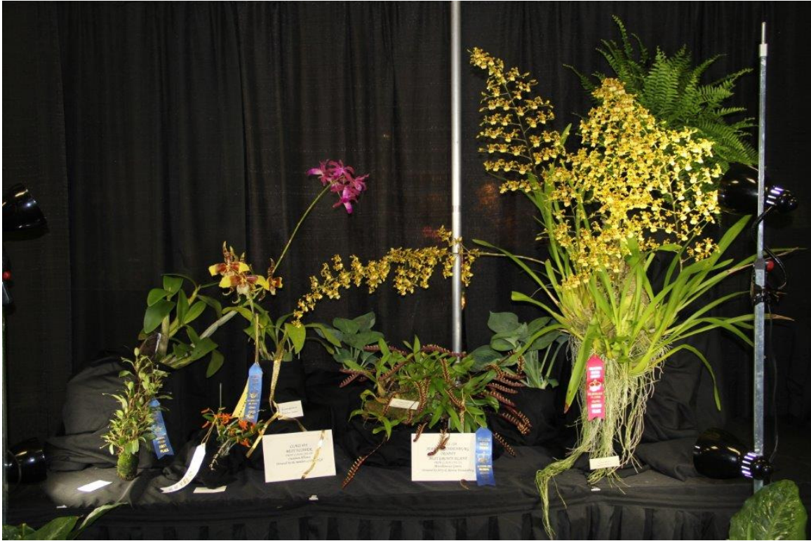
Vendor: Timbucktoo Orchids Sedgwick, Kansas