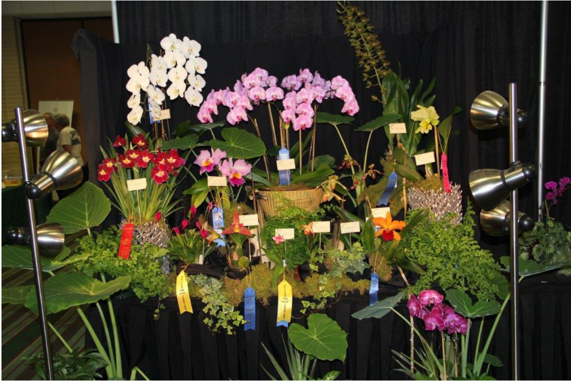
Vendor: Okie Orchids Oklahoma City, Oklahoma