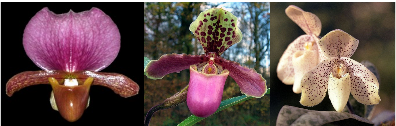
Cites Appendix I Listed Orchids

There is no point in protecting plants if you don't protect their habitats. Even though many battles seem to have been lost; we should help as an organization and as individuals to save orchid habitats by supporting conservation and funding efforts such as Orchid Conservation Alliance.