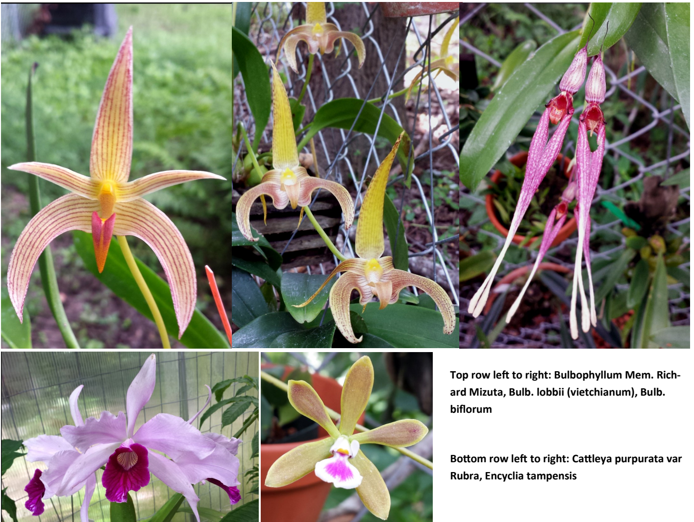
Top row left to right: Bulbophyllum Mem. Richard Mizuta, Bulb. lobbii (vietchianum), Bulb. biflorum