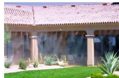
Micro irrigation turns a patio into an orchid oasis