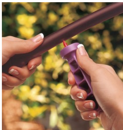
A punch tool and half inch tubing

emitter heads which really wont be practical for this installation but come in handy for landscape plants. There will also be a little punch tool and some "goof" plugs to fill in mistakes. With your half inch line in hand began to plan a path that will reach generally all parts of your grow area. Once you have it figured out your can zip tie it to any available object running near by. Then with a goal of creating an even coverage of mist begin to use the punch tool to put holes in the half inch tube and insert the misting heads. Usually about every 2-3 feet will cover plenty. Any areas that are hard to reach you can use the quarter inch tube and a couple of connectors to branch out. Once you have the system set up you will need to connect your timer, filter, pressure regulator and connector together. The back of the box usually gives you a good idea of the order these pieces need to go in. Hook up your garden hose and set the timer and your ready to mist! It really is that easy to create an outdoor oasis for your plants.