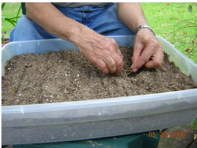
Figure 1 Planting the seedlings