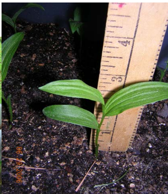
Figure 2 Seedlings two weeks old